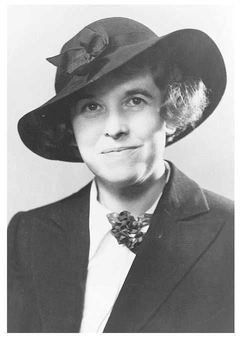
1. Hallie Flanagan, American Women Collection, Law Library of Congress. http://hdl.loc.gov/loc.pnp/ppmsca.03004.

Flanagan's extensive knowledge of drama and theatre, her vision, integrity, originality and immense energy, her ability to bring out the best in artists and ignite the imagination and energy of