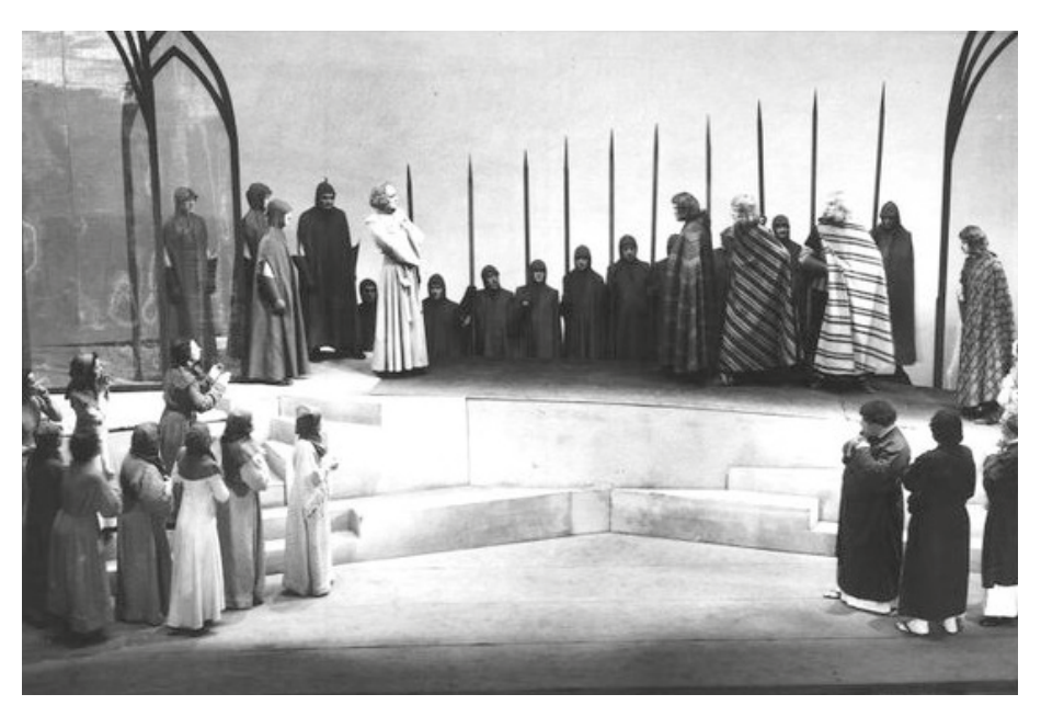
12. Scene from Murder in the Cathedral