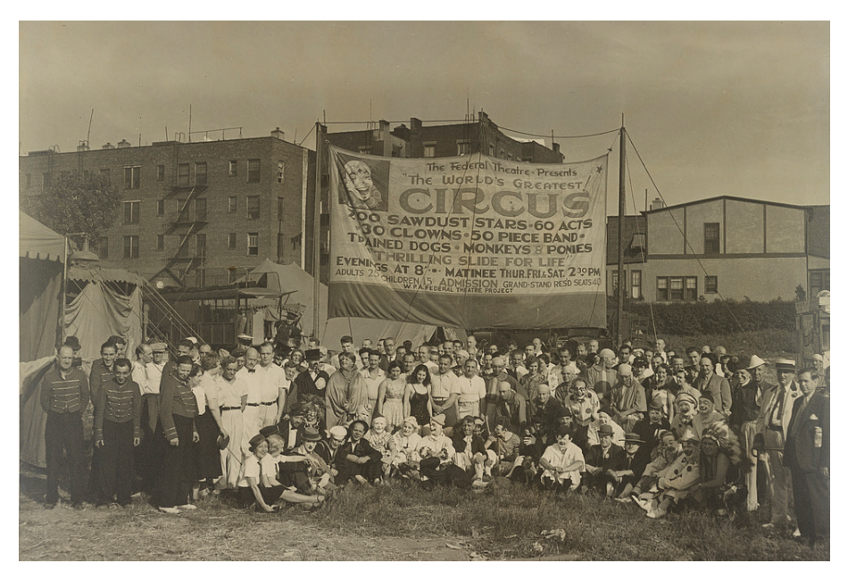
11. Federal Theatre Circus, Prints and Photographs Division, Library of Congress. https://www.loc.gov/resource/ds.01244/