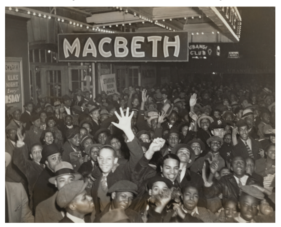
15. Crowd outside Lafayette Theatre on opening night, Classical Theatre, « Voodo » Macbeth , Library of Congress. https://www.loc.gov/exhibits/federal-theatre-project/gallery.html.

10,000 people stood as close as they could get to the theatre, jamming the avenue for ten blocks and halting northbound traffic for more than an hour ( fig. 15 ).