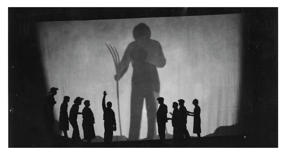
17. Scene from Triple A Plowed Under , "WPA Fed Theatre Project in NY. Living Newspaper production of 'AAA Plowed Under,"

Triple-A Plowed Under —dealing through pantomimes, skits, and radio broadcasts with the severe hardships of American farmers, the reasons for their immiseration, and efforts to solve their problems—was the Living Newspaper's first success.<sup>65</sup> The play's title refers to the Agricultural Adjustment Agency (AAA) that was established by the New Deal to cope with the problems of over-production and depressed farm prices by paying farmers to plow under their crops. Two months before Triple-A premiered, in January 1936, the Act itself had been judged unconstitutional by the Supreme Court, hence "plowed under" ( fig.17 ).