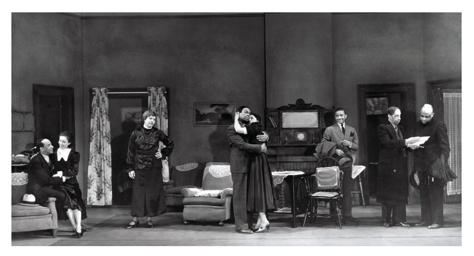
14. Scene from Negro Unit's The Conjur Man Dies , image from 1936 production, New Federal Theatre. https://newfederaltheatre.com/production/the-conjure-man-dies/.

mocking the attempts of former slave-masters to control their identity as free men. For black men to compel white men to address them as equals was a radical act ( fig.14 ).<sup>37</sup>