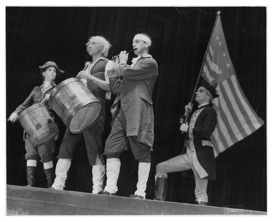
6. Scene from Created Equal Act 1, Scene 3

In addition, there were seventeen plays by native playwrights based on American history. Many of these, like Created Equal , based on the US Constitution, and Battle Hymn , about the anti-slavery champion John Brown, focused on the country's founding myths aiming to awaken the nation to its democratic ideal ( fig.6 & 7).<sup>31</sup>