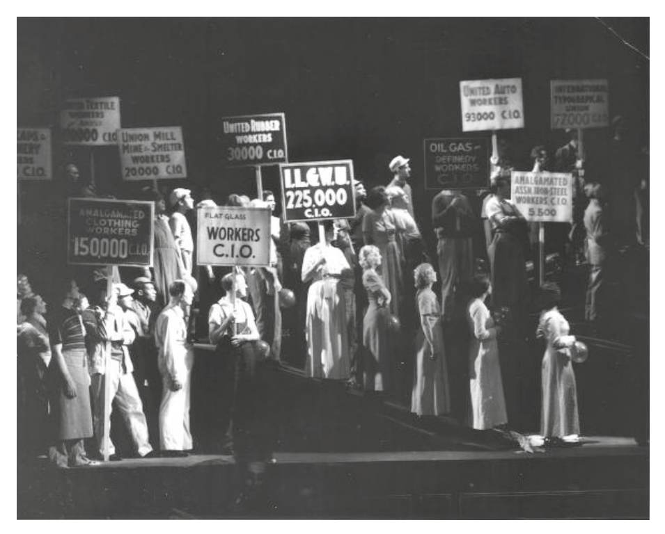
16. Scene from a Living Newspaper depicting striking workers. Art for Social Change Toolkit. https://artforsocialchangetoolkit.wordpress.com/history/livingnewspapers/#jp-carousel-141

scenery," reminding him that the documentary dramas she had produced at Vassar had cost next to nothing.<sup>50</sup>